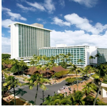
Sheraton Princess Kaiulani