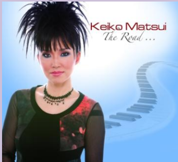
Pianist Keiko Matsui