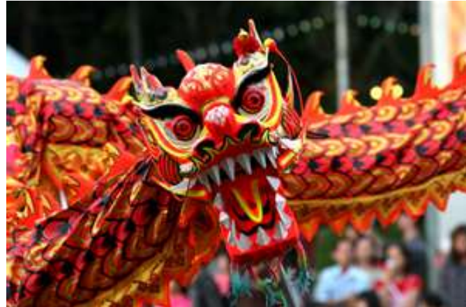
Gung Hee Fat Choy in this Year of the Dragon!