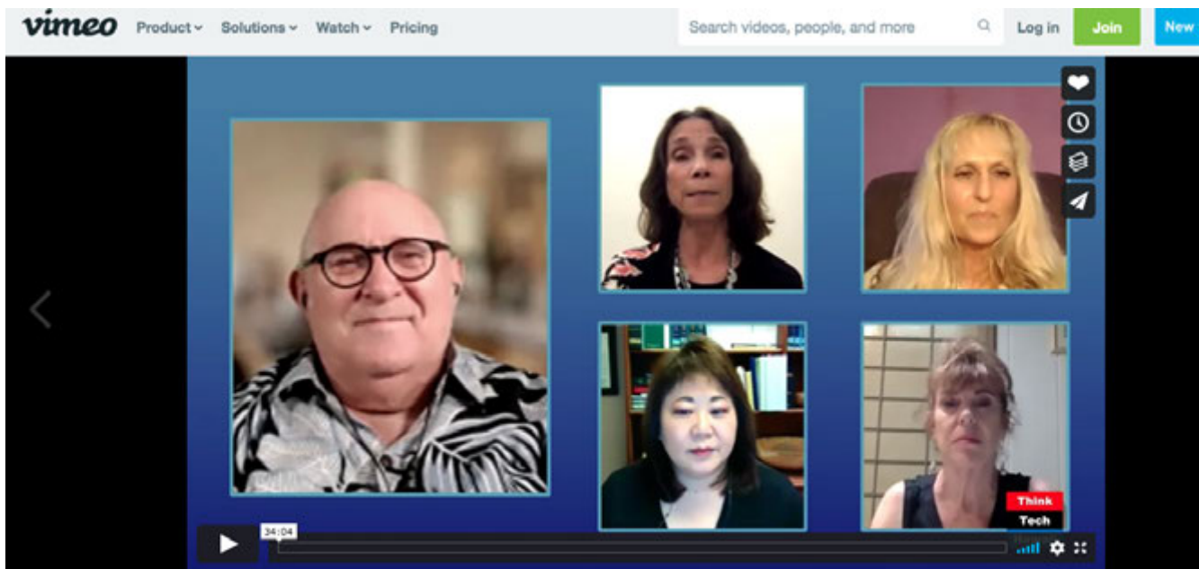
Mediation Center of the Pacific (Life In The Law)

Check it out here: https://vimeo.com/462852479